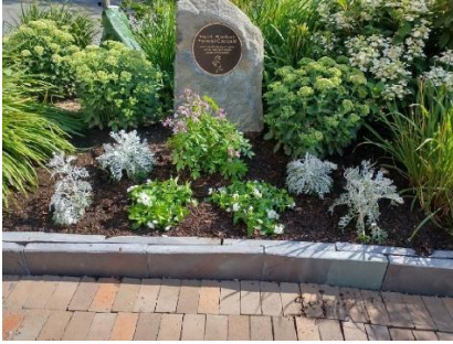
Alan R. Woodbury Courtyard

Overall, our events bring hundreds of people to our Designated Downtown area and, in turn, helps boost our small business' economy. These achievements are more than just improvements to our town - they are a testament to what we can accomplish when we work together.