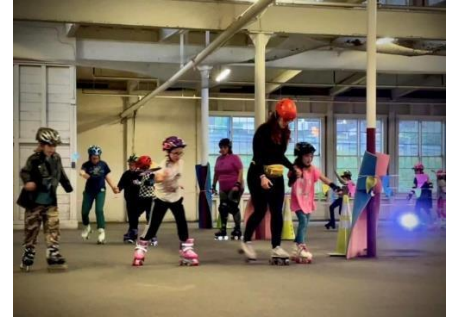
Rollin' on the River