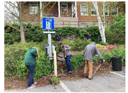
Paul Putnam Park