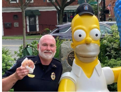
Zero K Donut Dash